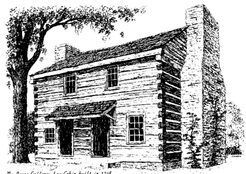
The James Galloway Log (obin built in 1798, o part of the Greene County Historical Society Complex.

The Greene County Ohio Historical Society 74 West Church St. Xenia, OH 45385