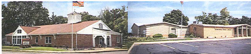
COLUMBIA BRANCH 13824 W. River Road North Columbia Station, OH 44028 • 440-236-8751