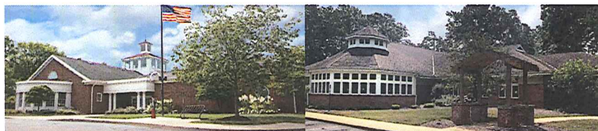
NORTH RIDGEVILLE BRANCH 35700 Bainbridge Road • North Ridgeville, OH 44039 440-327-8326