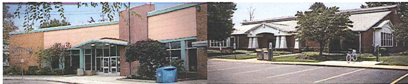
MAIN LIBRARY 351 W. Sixth Street • Lorain, Ohio 44052 440-244-1192

Our communities are vibrant and diverse, our libraries world class. We are looking for dynamic individuals to be part of our team. Come join us!