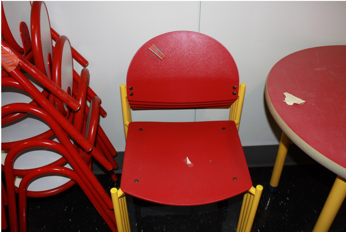
Item 10: children's table, 36" round, which matches Item 9, chairs (red with yellow legs)